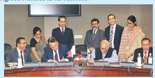
Hon Dr. Prakash Sharan Mahat, Minister for Foreign Affairs of Nepal and H.E Mr. M. J. Akbar, Minister of State for External Affairs of India

The meeting made a comprehensive review on all aspects of Nepal-India relations under five broad clusters namely political, security and boundary; economic cooperation and infrastructure; trade and transit; power and water resources; culture and education. The meeting adopted Agreed Minutes as its outcome.