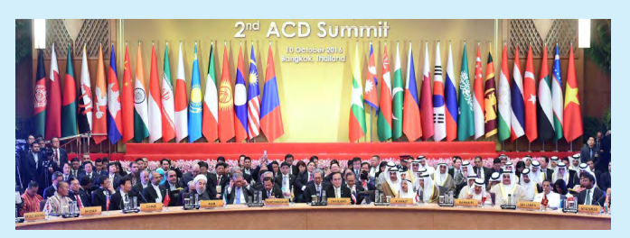
Inauguration ceremony of the 2<sup>nd</sup> ACD Summit, Bangkok

The Second Asia Cooperation Dialogue (ACD) Summit was held on 8-10 October 2016 in Bangkok, Thailand with the theme of 'One Asia, Diverse Strengths'. Hon. Dr. Prakash Sharan Mahat, Minister for Foreign Affairs led the Nepalei delegation in the Summit which was attended by the Heads of State and Government, and other high-ranking government officials of 34 Member States. The Summit Meeting was inaugurated by H.E. General Prayut Chan-o-cha, Prime Minister of the Kingdom of Thailand which adopted three Outcome Documents; ACD Vision for Asia Cooperation 2030, Bangkok Declaration along with ACD Blue Print 2017-2021, and ACD Statement on Reigniting Growth through Partnerships for Connectivity.